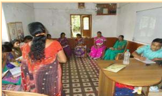
Bal Panchayat Teachers Review meeting