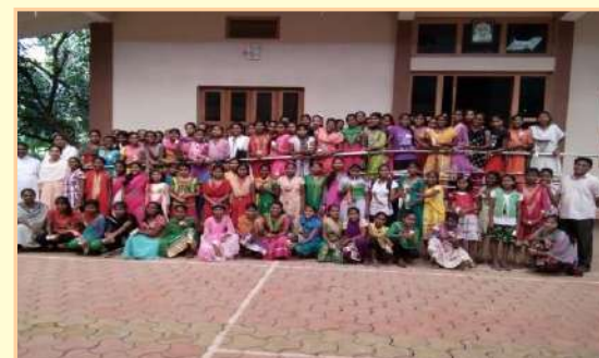
Excursion Visit of Pota cabin Students