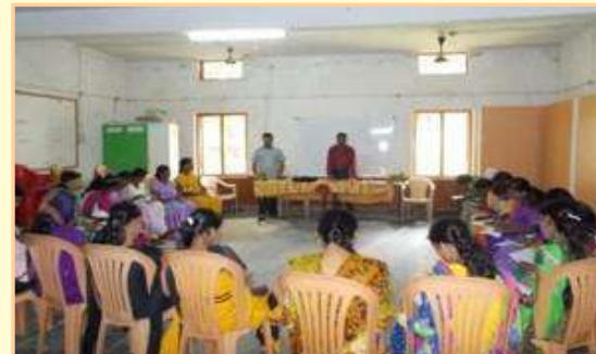
Bal Panchayat Teachers Training Programme