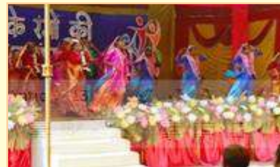
Cultural Programme in POTA cabin Palnar