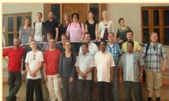
Visit from Germany