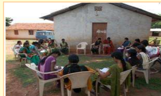
Workshop for BalPanchayat Tuition Teachers