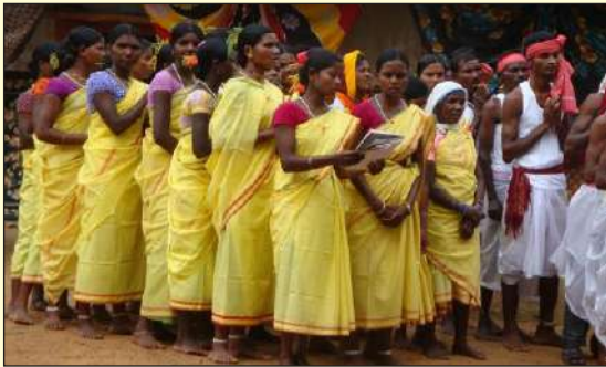
Welcome of Visitors at Mardoom