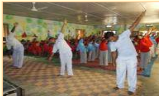
Morning Exercise POTA Cabin Palnar