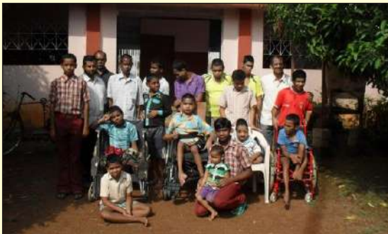
Inmates of Asha Ashram