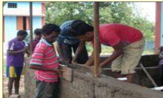
POTA Cabin Palnar – IBT Practice