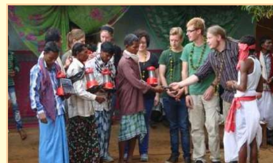
Distribution of Solar Lantern