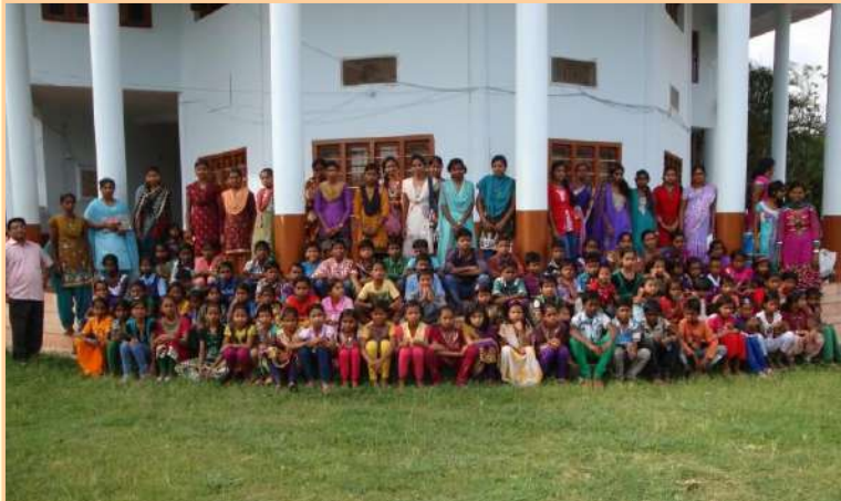
Bal Panchayat Staff & Students