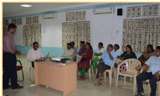
Workshop for Eye care staff