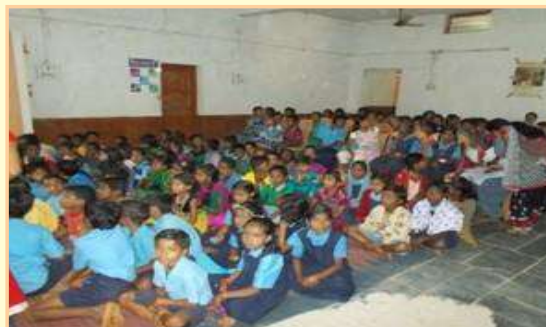
Bal Panchayat members in Bal Divas