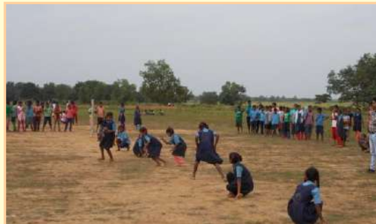
Bal Panchayat Sports Meet