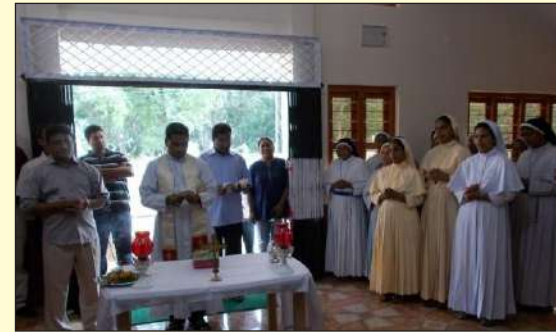
Blessing of CCC