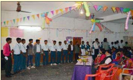
Batch Inaguration Programme