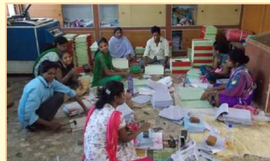
Staff of Nirmal Printing Press