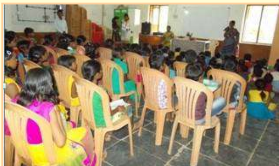
Bal Panchayat Members Training Programme