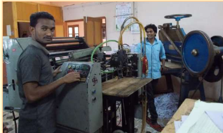
Nirmal Printing Press