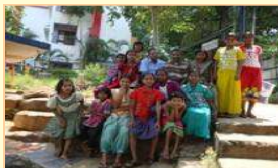
Students visit to Bastar hat