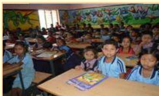
Self Study in Study room