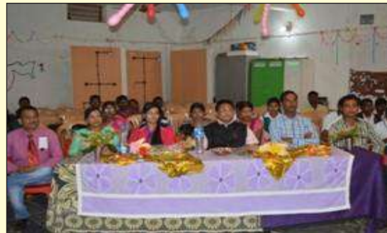
DB Tech Skill Development Programme