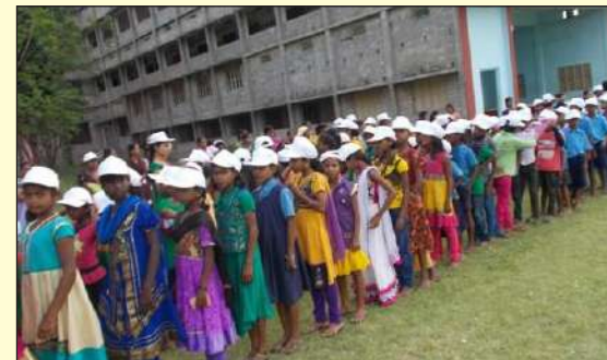
Entrance fest & Rally